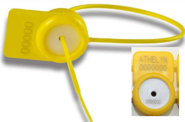
Maglock with optional printing tag