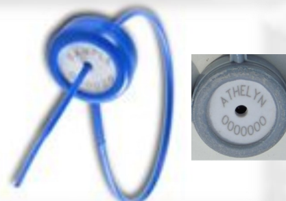
Maglock without printing tag

The Maglock is a small nylon security seal with a stainless steel locking insert for enhanced security and a thin 1.3mm strap. This seal is sited for sealing meters and other small apertures.